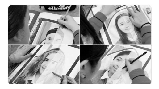
Face painting fun at break