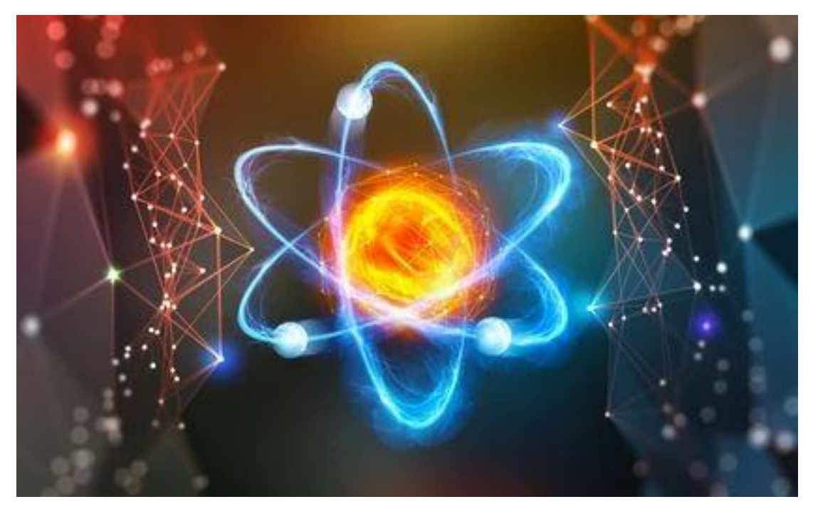
Mol an Óige agus Tiocfaidh sí

Astronomy (Astronauts to Telescope designers), Medicine (Doctors to Surgeons), Radiology (Medical Physicists to Radiographers), Architecture, Engineering (Mechanical to Electrical), Meteorology, Renewable Energy, Computer Programming, and Optometry.