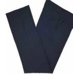
Senior Half-Zip PE Top