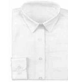
Ratoath College Boys Navy Trousers