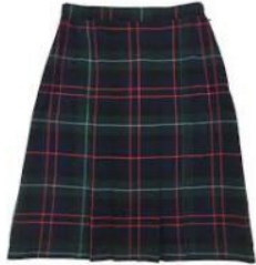
Ratoath College Skirt